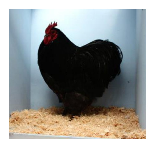
Champ Orpington Victorian Rare Breeds Show