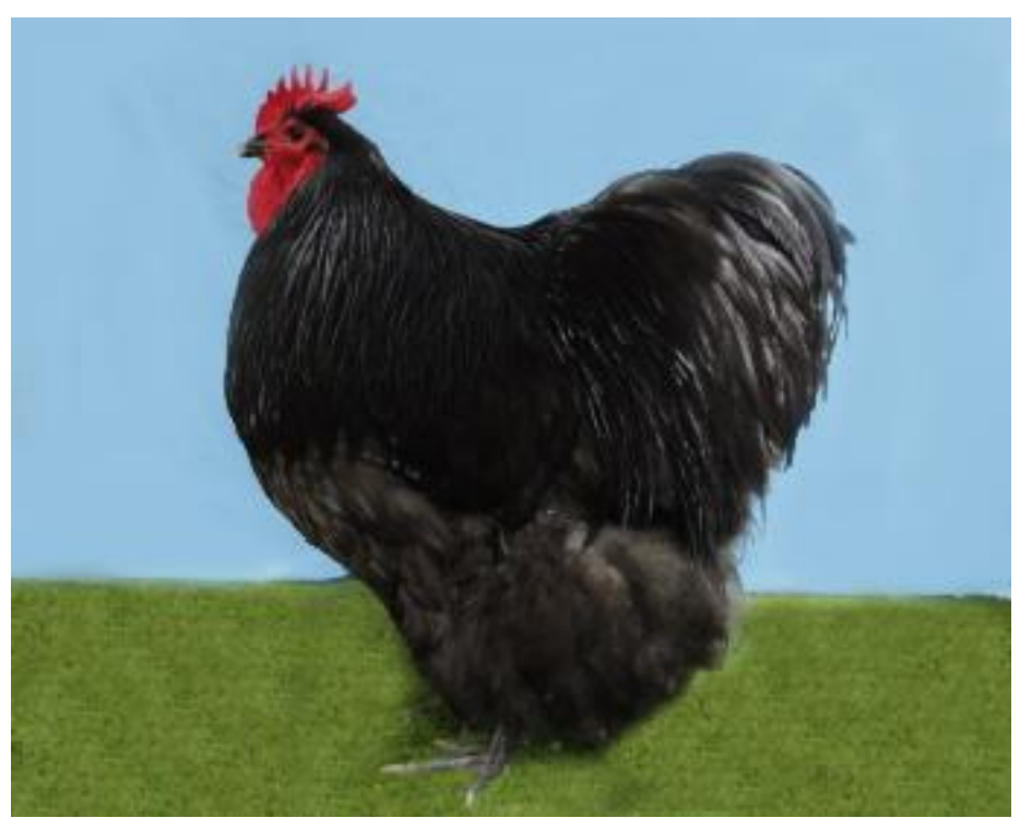
Champion Bird of Show at the 2013 Southern Feature Show Lloyd is a March 2012 hatched Large Blue Cockerel. He also went Reserve Champion Bird in Show at the 2013 National and Champion Bird of Show at Gippsland Riviera Poultry Club Annual Show (504 Birds) Beautifully bred, owned and presented by Vicki Jerrett

Established in 1985 the Orpington Club of Australia is dedicated to promote and protect this stately breed.