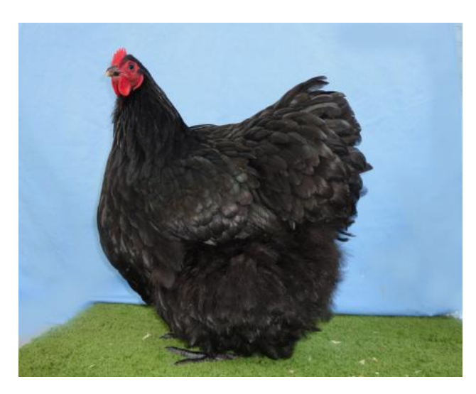
Ch Large Black – Pullet- Sonya Ford