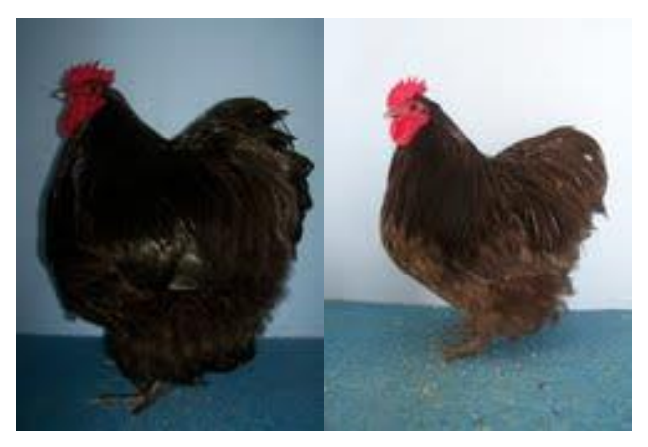
Figure\ 1\ Ch\ Orpington\ @Dubbo\ PC\ Feature-Large\ Black\ Ckl\ shown\ by\ Chris\ Hardman