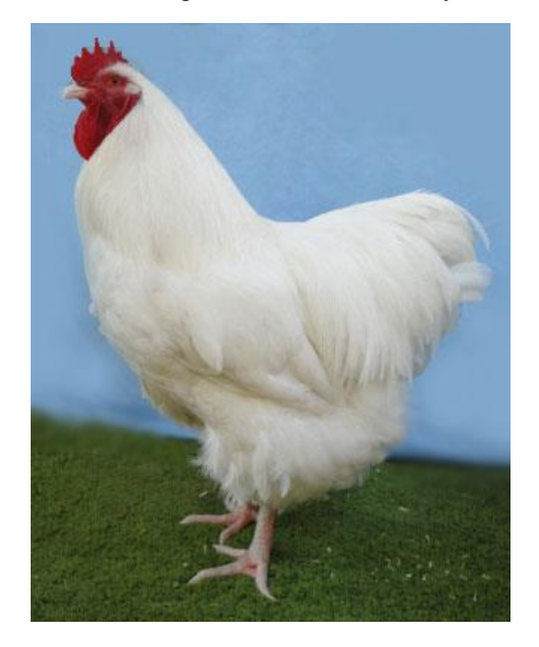
Ch Large White Sonya Ford