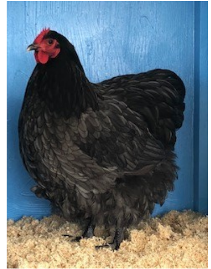
Champion Orpington in Show Standard Blue Pullet D & J Stannard

BUFF: The cocks were small in numbers but showed potential. The hens were a mixture with some being way too fat for long jeopardy, others too course in the head and sunken eyes but maybe that was age. The winning hen combined features got her across the line on the day. The cockerel's numbers were encouraging with a few quality birds showing promise with the depth of colour so important with breeding buffs. The "Champion Buff" came from this class with good feathering and type.