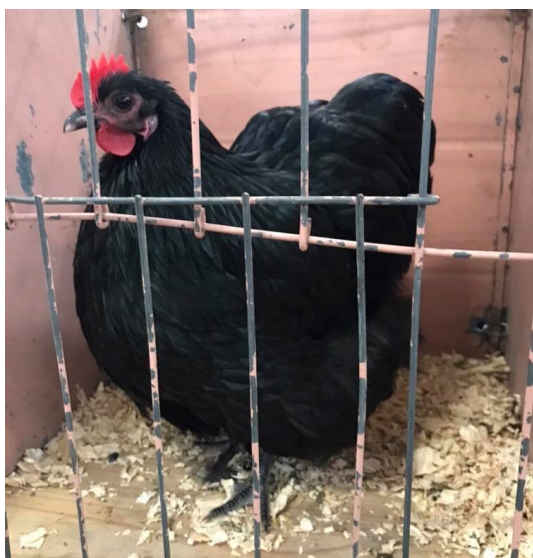
Champion Bantam Orpington Wananga Orpingtons