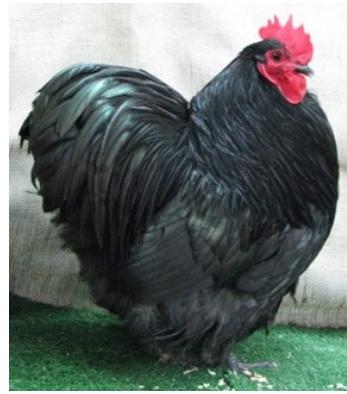
Res.Champion – Bussian Bantam Black Cockerel