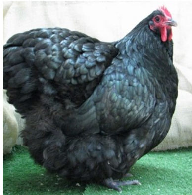
Champion – Bussian Standard Black Pullet

Our first northern feature show for the year was held at the Darling Downs Poultry & Pigeon Breeders annual show, the first Sunday of June. A great line up 92 Orpington – 55 Standard and 37 Bantam with a good representation across all the recognized colours together with some good examples of developmental colours, judged by Michael Collins.