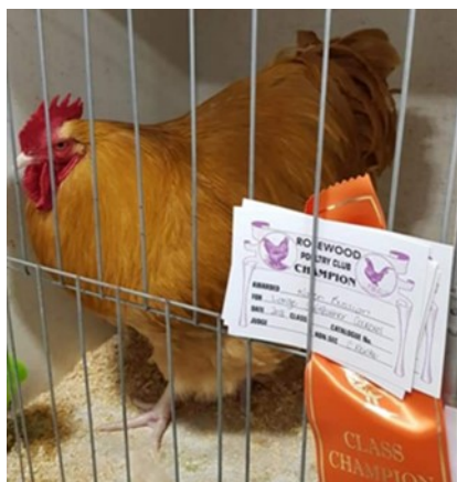
Res. Champion Std. Orpington of Show Buff Cockerel – Bussian