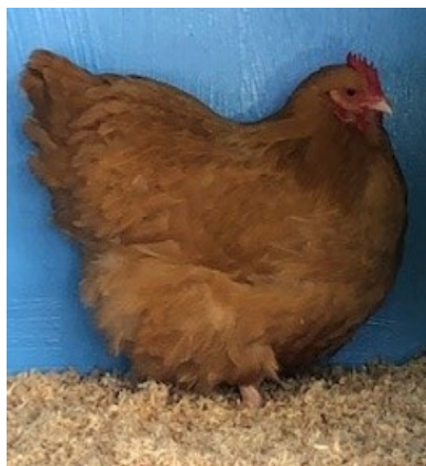
Reserve Champion Buff Orpington M. Gavenlock

BUFF: Winning Cock bird was a good overall bird but had comb a bit large with the winning Hen showing good type and gaining "Reserve Buff". The Cockerels were won by a good coloured male who also was awarded "Champion Buff" due to his good type combined. The pullet class was won by a bird that was just a bit too fluffy.