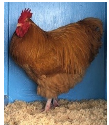
Champion Standard Buff Orpington M. Gavenlock