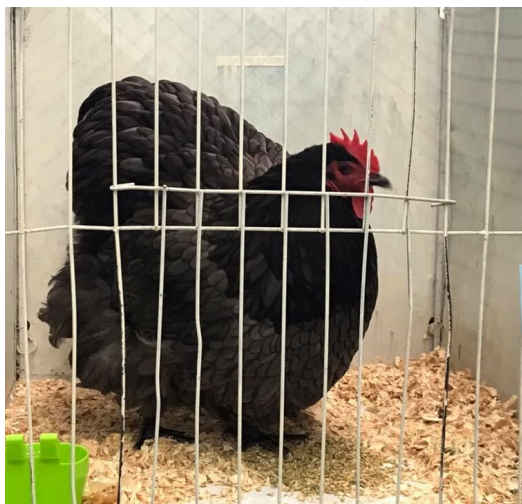
Champion Orpington in Show Standard Blue Pullet