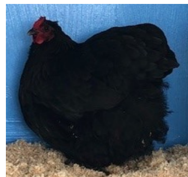
Reserve Champion Bantam Orpington Champion Black Orpington C. Hardman