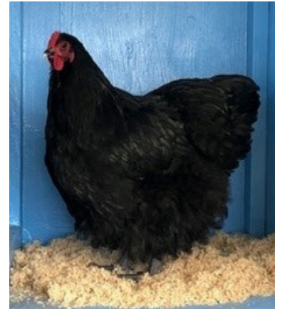
Reserve Standard Orpington Champion Black Orpington D & J Stannard