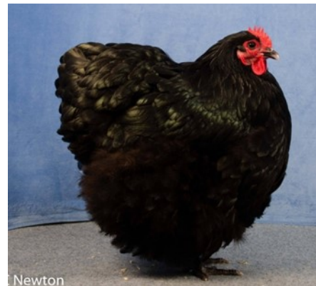
Champion Orpington of Show – RNA Brisbane (EKKA) 2018 Standard Black Pullet – Bussian