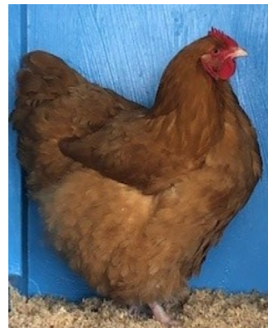
Reserve Standard Buff Orpington M. Gavenlock