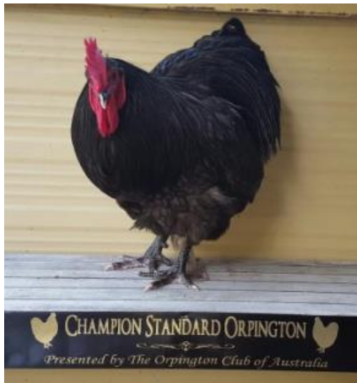
Champion Standard- Cliff Weichert