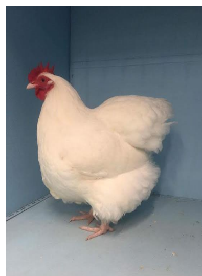
Reserve Bantam – Lester Flint White hen