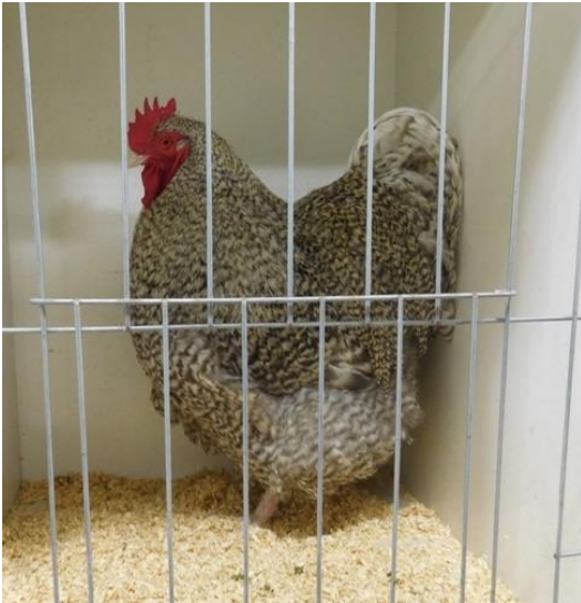
1st Placed A.O.R.C Cockerel, shown by R.Daley

Greeting from the West. What an exciting year 2016 has been for Orpington showing in Western Australia. After the past success of Orpingtons in our state going back 20-30 year ago, recent years have been quite with only a few established breeders still exhibiting at shows. But this year we have seen some great increase interest and numbers back at shows. Many thanks to The Orpington Club of Australia who has kindly sponsored 5 shows this year. Here are some pictures and results from around the sheds at this year's sponsored shows