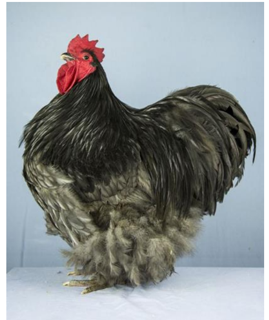
Res Champion Soft feather & Champion Orpington Heavy RMPS 2016 Large Blue Cock Bird (same bird 2nd year running) Wanina Orpingtons