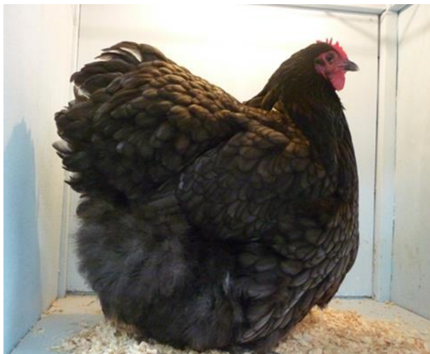
Champion Bird of Show – Tasmanian Rare Breed Poultry Club Owned by Sonya Ford