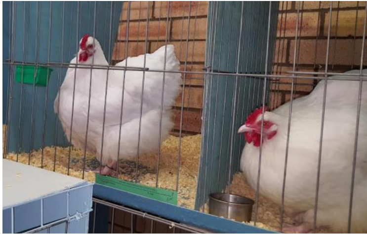
White Pullet – Cliff Weichelt