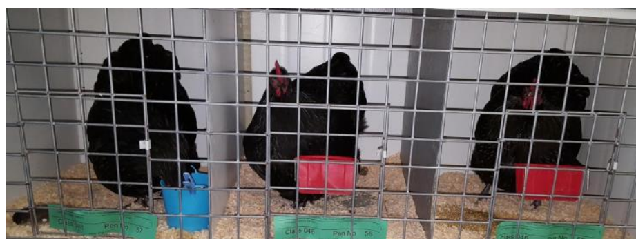
Black Bantam Females