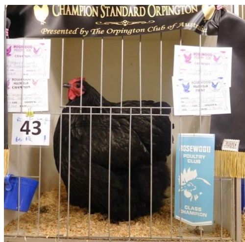
Champion Standard Orpington;

The Rosewood Poultry Show had a considerable turn out, with a total of 86 Orpingtons entered. This sub-divided to be 56 standard large, and 31 standard bantams. This was a little less then expected from previous years, however, can be disregarded because of how close the Nationals were to this event.