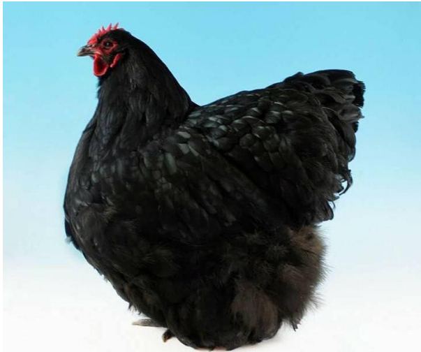
Best of breed national poultry show UK 2016