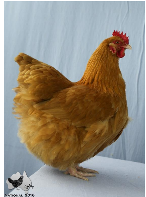
Champion Standard Buff Orpington M. Gavenlock