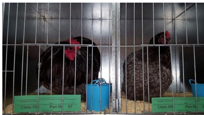
Blue Bantam Cockerel and Pullet – Brandon Baker