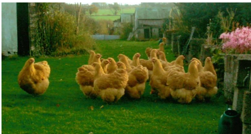
A line up of Burdett Buffs.