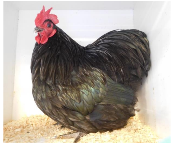
Reserve Bantam & Reserve Champion Black;