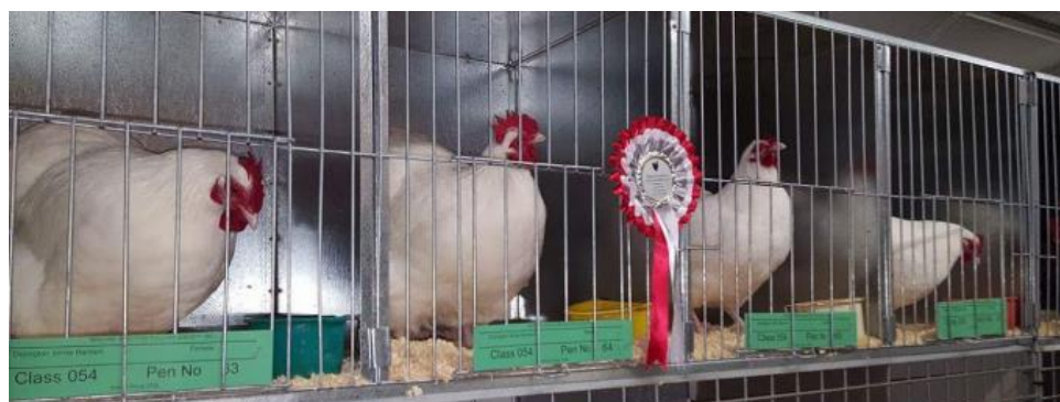
Beautiful row of White female bantam – Lester Flint