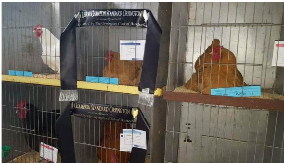
Bufs winning both Champion and Reserve in Standard and Champion Bantam as well. Great day out for the buffs.