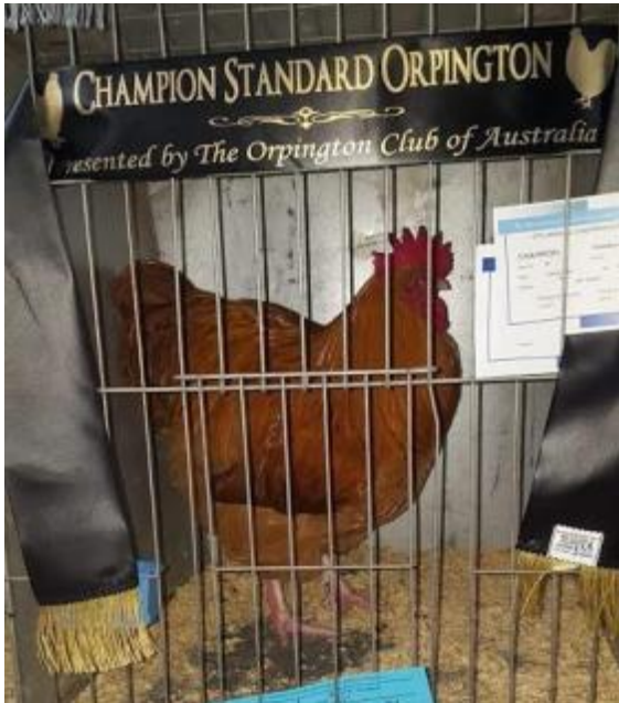
Champion Standard buff cockerel Cliff Weichelt