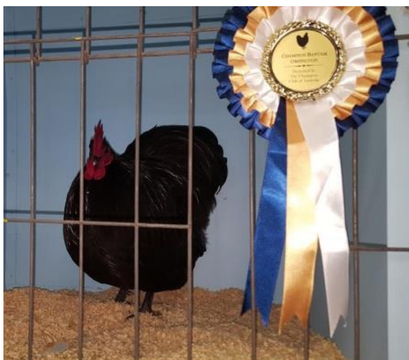
Champion Bantam and Best feature breed bantam – Cliff Weichelt Black Cock bird