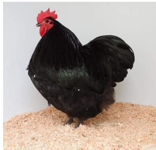
Champion Bantam and Champiom soft feather heavy breed bantam –Cliff Weichelt Black Cock bird