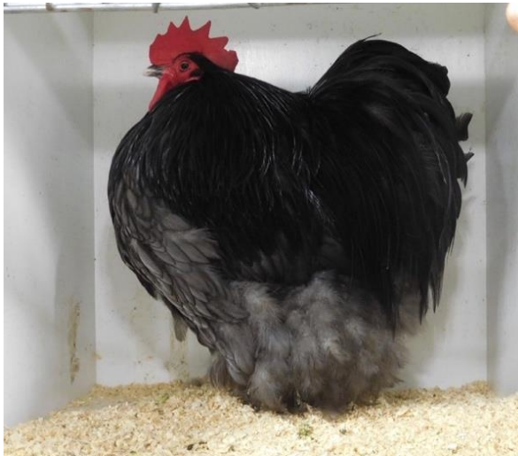
Reserve Standard Orpington;

With a high amount of Orpingtons Breeding growing here in Queensland, The decision was made to take on board another club which was able to cater for. With some great clubs in Queensland speaking with fellow members, we decided that Darling Downs Poultry & Pigeon breeders Assoc inc, would be the perfect place to hold another Orpington show.