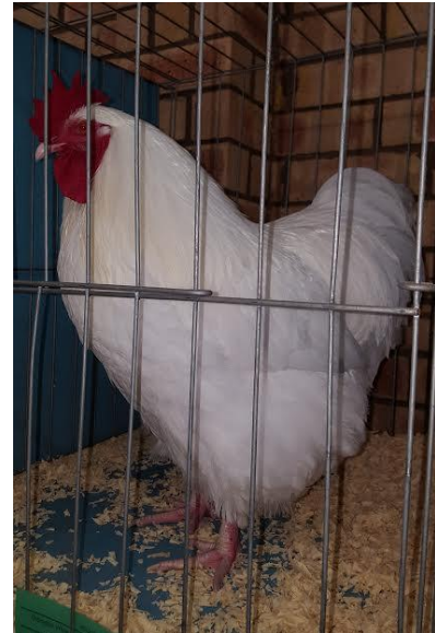
Best White Cockerel – Lester Flint