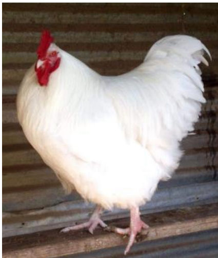
Champion Standard Orpington Lester Flint