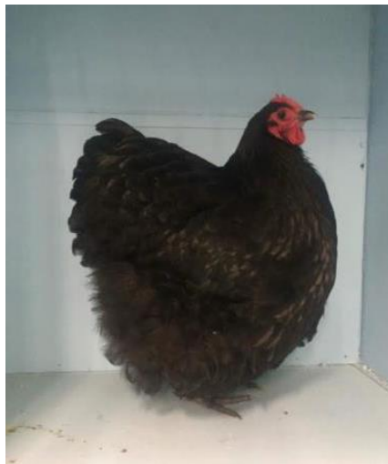
Champion Standard and Best feature breed standard- Cliff Weichelt

This year the annual club show had 2 feature breeds being Frizzle and Orpington. Great to see more numbers in our State at shows again. 29 standard and 12 bantam Orpingtons in Show.