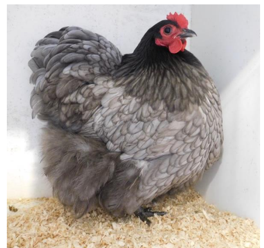
Blue Bantam Pullet, shown by K.Bussian