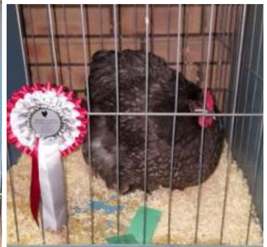
Reserve Champion Standard and 1st blue Female – Cliff Weichelt