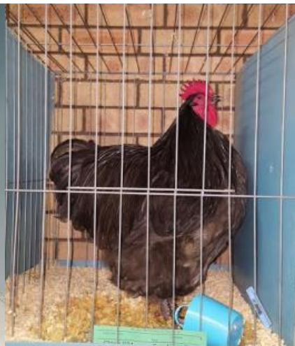
Best Blue Male Standard – Brandon Baker