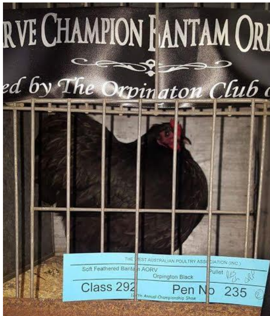
Reserve Champion Bantam – Brandon Baker Black pullet