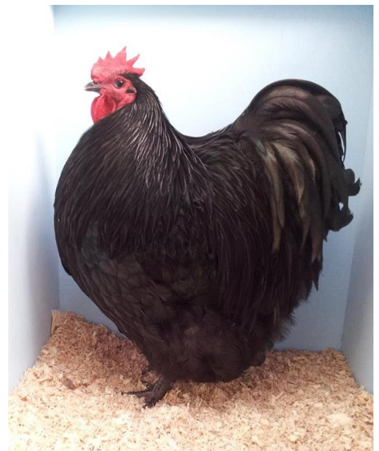
Reserve Bird in Show – Royal Launceston Show 2016 owned by Sonya Ford Champion Soft feather Heavy Warragul P.C.