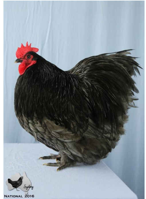
Reserve Champion Bantam Orpington C. Hardman

COCK – 2 OF, not much between 1 ST and 2 ND . Winner stronger in under colour. HEN – 1 st winning hen lovely size and top colour, 2 nd – nice female a little light in undercolour, 3 rd – lacked the size of first two females.