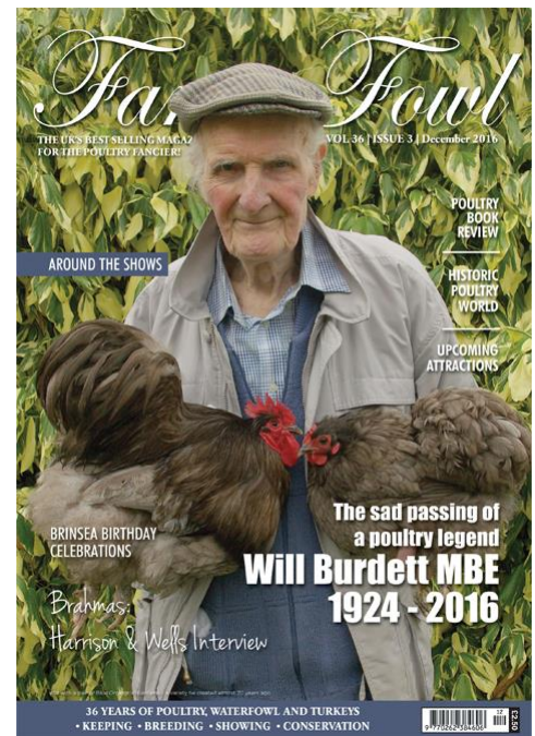
December's Fancy Fowl magazine – A tribute to Will