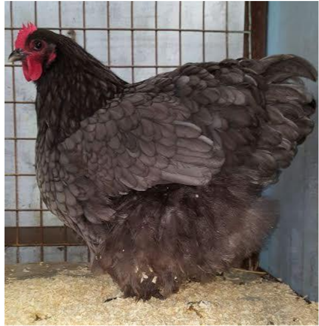
1st AOC Female Standard – Cliff Weichelt Blue pullet