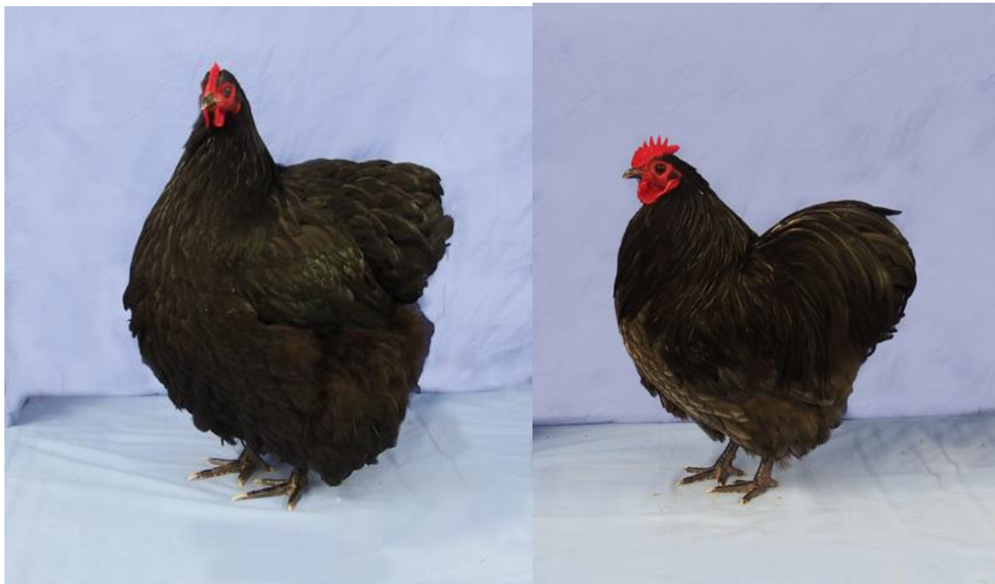
Champion Orpington in Show- Standard Black Pullet – Sonya Ford Reserve Orpington in Show – Bantam Blue Cockerel – Vicki Jerrett

For all information about the Orpington Club of Australia go to; www.orpingtonaustralia.com