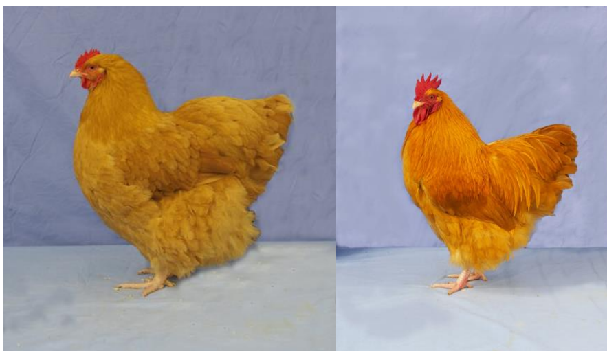
Reserve Champion Orpington Large- Buff Pullet – Simon Beven