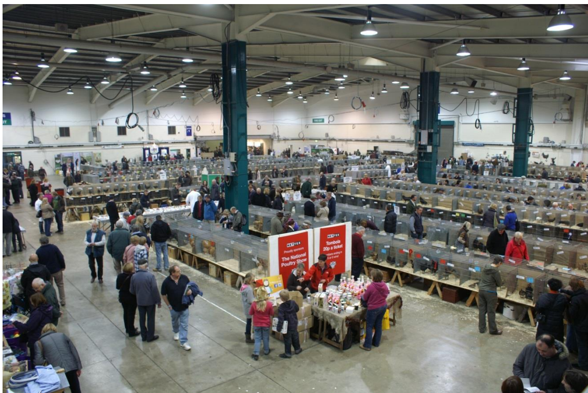
The Halls at Stoneleigh Park

The trophies at the UK National are handed out by the Master Poulter, a presidential figure of the Company of Poulterers from the City of London. No its not President Blue but it sure looks like one of his relatives! Starts to set the standard of Presidential dress we should be expecting at our National Club Show now doesn't it????