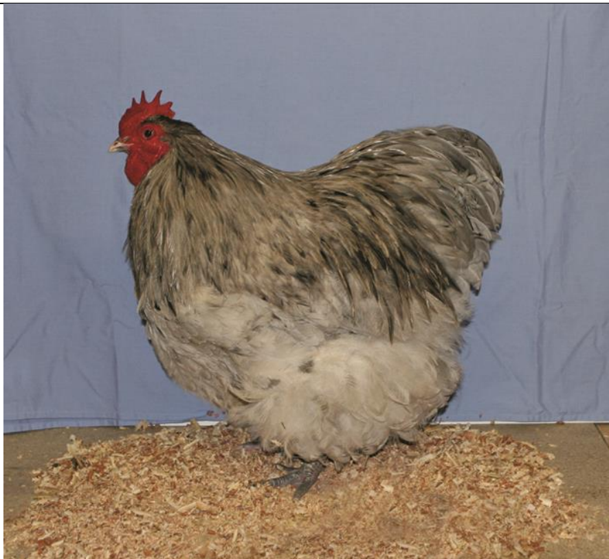
Champion Large Splash at the Clubs 2012 Northern Feature Show.