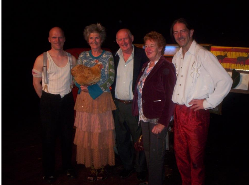
The Actors and the Star Buff of the Show

The next day I thought I would see just how quiet they really were and got a shock. They were just the same flighty highly strung things that they used to be. The actors were very good at handling birds alright.